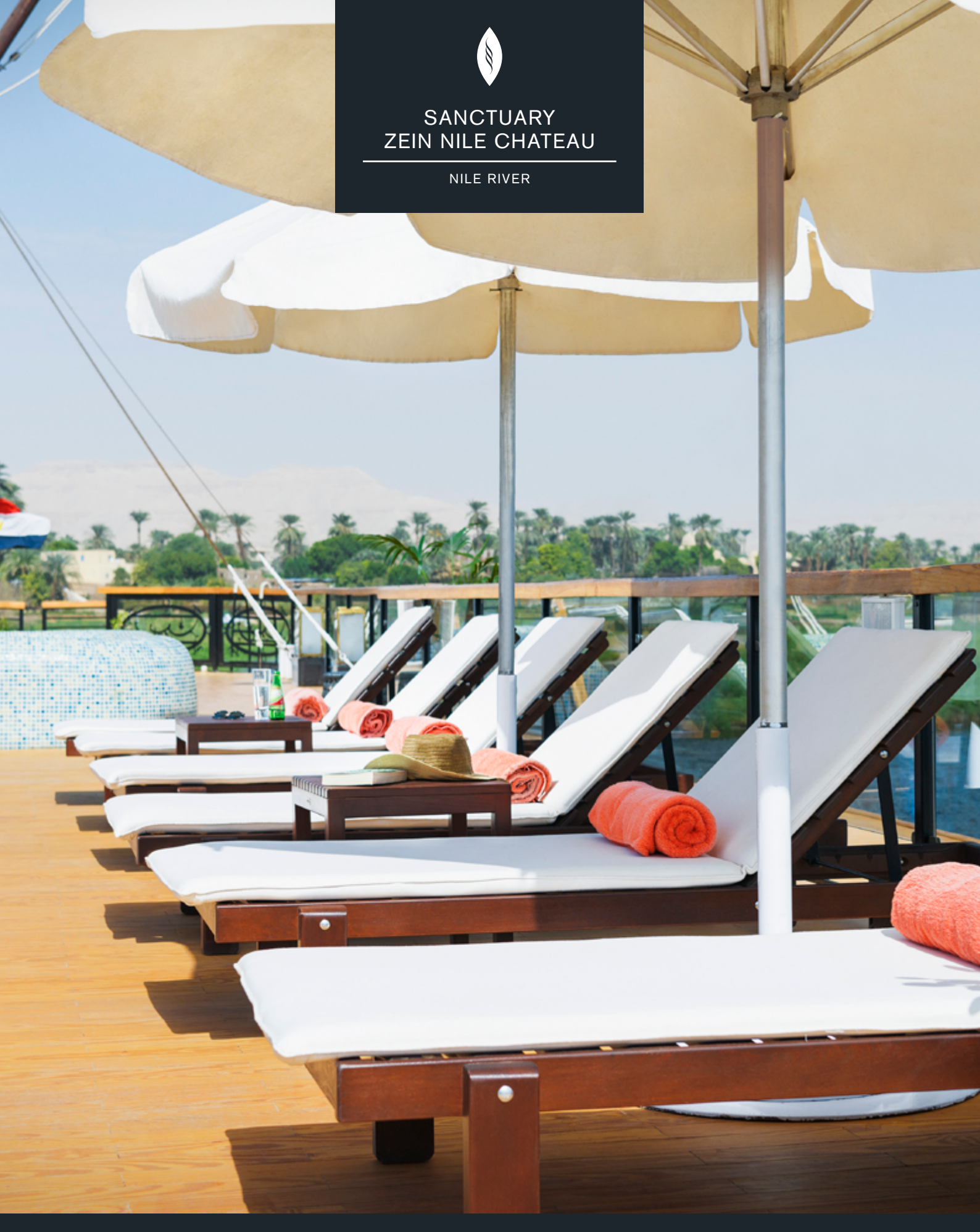
EGYPT: 6 CABINS